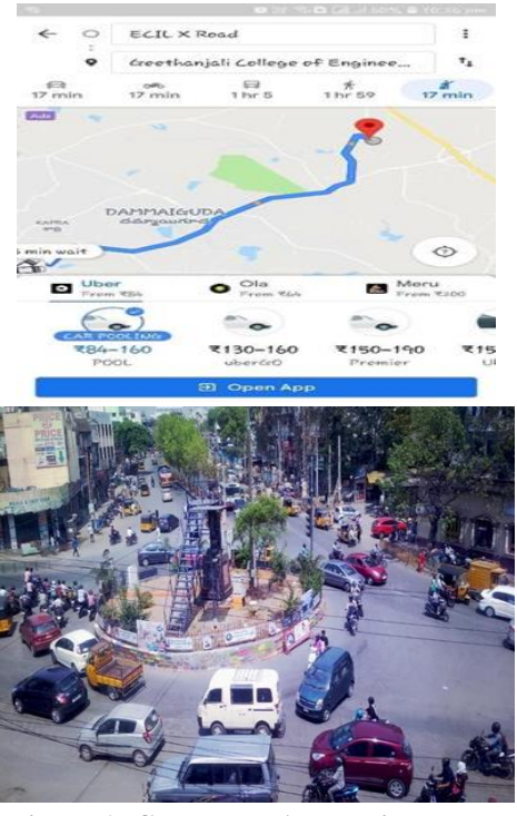
Figure 1: Case study Area Ecil X roads

Data collection forms the backbone of any research activity and it is apparent that many meaningful conclusions can be drawn only based on the analysis of reliable data. The procedures adopted for data collection should fit in the framework of objectives and the surveys are to design with a view analysis aspect also. This chapter presents the various surveys conducted along with the details such as location factor, formats employed and procedures adopted.