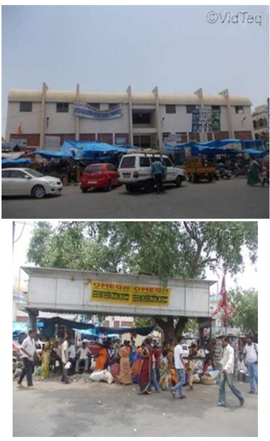
Figure 2: Traffic flow at kushaiguda

Traffic flow at kushaiguda, from this junction we connect to all the major roads and the reason for heavy flow is Parking of vehicles is not provided and they are parked on the road itself. Even the crossings are difficult for people and also we can see many cracks on the road.